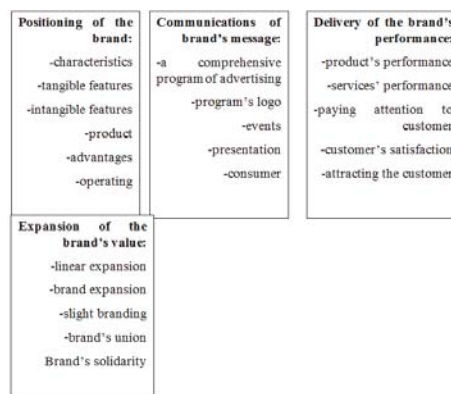
Figure 1: The stages of branding model of PCDL (Ghodeswar, 2008)

Different modes for branding of products, services and the cities are presented. The model that is used in this study is PCDL model. This model is based on the study of Indian companies is presented by Ghodeswar (2008) and includes four steps: Positioning of the brand, communicating of the brand's message, delivering of the brand's performance and leveraging of the brand's value. Figure one shows the stages of this model.