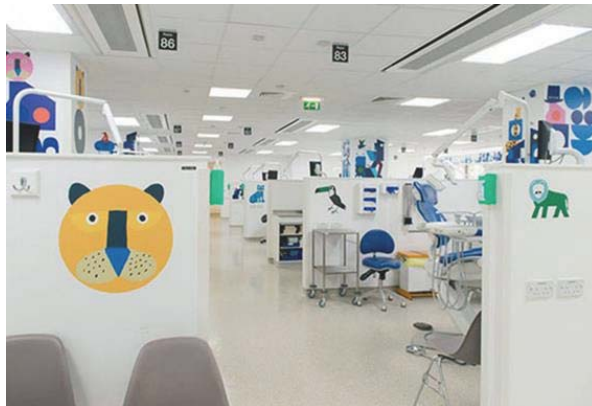
Figure 2: Environmental Graphic

The role of space and environmental graphic design cannot be ignored in the interest of children to different environments. The art with the appropriate use of forms, volumes and colors in environments involving children has a different role. Environmental graphic of child actually stimulate children's creativity and raises his curiosity. Children need an exciting environment to be motivated to provide the best in them. Children like large spaces for bouncy activities and small spaces to retreat. (Asadollahi, 2010)