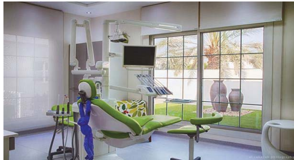
Figure 5: Benefiting from natural daylight

Daylight lighting is a process beyond creating a right condition for seeing objects. "This process has special emotional qualities that can apparently affect the moods of the public. In this process, its perceptual aspect is more important than other aspects." (DiLouie & Craig, 2002) In environments for children, lighting with severe contrast should be avoided because it causes fatigue in children. The more the use of natural and milder light, it is better. In addition, natural light makes the color elements in the environment be seen in their true colors. (Sattaari & Egbali, 2014)