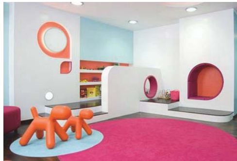
Figure 1: Game, the basic needs of children

Children's games teach them mapping, exploration, construction, imitation and imagination, when children feel depressed and stressed, the need is necessary. Game makes children comfortable and confident in unfamiliar and daunting positions. Game helps children to know themselves by learning environment strategies. Multi-faceted nature of the game is related to "drugless treatment". The game is not just for passing time or refreshment, the effectiveness of game in hospital along with therapy by distracting children has been discovered using studies in behavioral science. (Talebi & Pashaii Kamali, 2015)