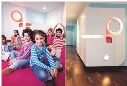
Figure 1: Games, Needless Fundamental Children

Game fosters talents, abilities, capabilities of children and strengthens their mind, body and soul. Mitscherlich believe that children and adolescents need to have a relationship and playing with animals and natural elements such as water, soil, plants and play spaces. (Mitscherlich, 1969)