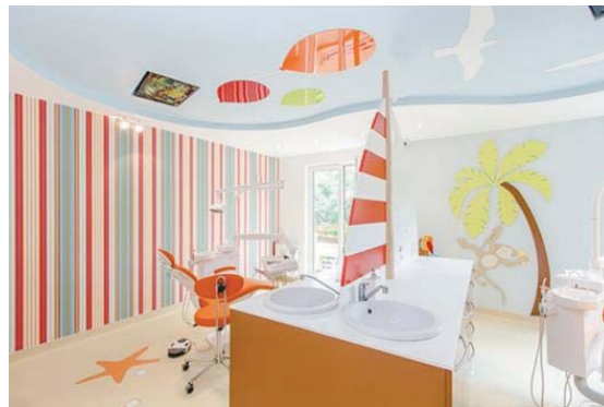
Figure 4: Effect of color on environment