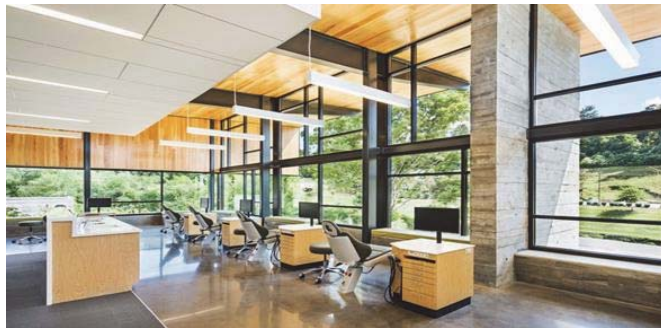
Figure 3: View to the green area from the window

Pretty et al., in their study, placed four groups of people in urban and rural environment in the favorable and unfavorable prospects and examined the effects of exercises on their physical and mental conditions. Rural and urban environments with good prospects have positive and significant effects on blood pressure, self-esteem and mental health. (Pretty, Peacock, Seliens, Griffin, & Murray, 2005)