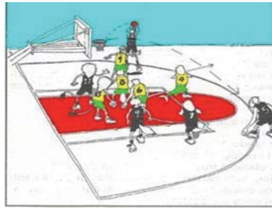
Figure 5. Position wrong

In a program chosen correctly can be instead an error during the execution due to an inadequate control of the movement. When a beginner has not mastered a motor gesture, or when an experienced player can not control an automated movement, because of emotional factors related to the performance or simply to fatigue, a motor program correctly chosen not is perfectly realized. The two types of error, however, can occur simultaneously. In the sport of situation, like basketball, the purpose of the feints is precisely to induce the opponent at start a motor program inappropriate, because the change takes more time.