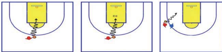
Figure 1. Entrance central in 3th time Figure 2. Entrance central with obstacles Figure 3. Lateral entrance with defender

A methodological aspect to consider is that the variable practice is not advantageous for the achievement of immediate objectives, but it becomes to long-term objectives, especially in the sports of situation (basketball, volleyball, soccer, etc ...), which require the adaptation of the technical gesture to changing conditions (Figures 1, 2, 3, 4).