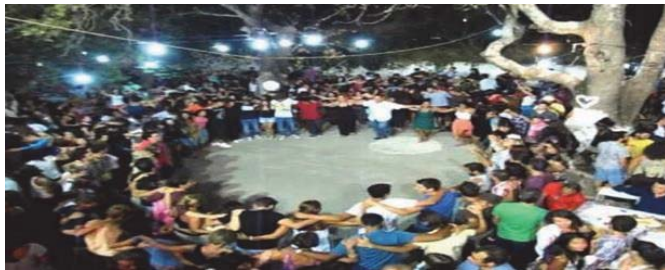
Photo 4: Participants in the fest of Agioi Anargiri in Karavostamo village, Ikaria (2012).

" Tsamourikos or Pemariotikos " has small movements, sharp and twisted, in the place with direction to the right. This form was mainly danced from the older people representing slowly a declining course to destination (the dance of the elderly " kounistos "). " Rachiotikos " was danced more from the new generation with more dynamic movements, the last years however, part (A) is not performed any more. Today, we meet a new form which is called " New Ikariotikos ", (Photo 4). It is an evolution and combining of all forms, analyzed before, without having any difference and it is danced especially from the new generations. (Fradelou, 2008; Pitakka, 2005). Pasxari-Koukoulia "...from the dancers of the modern fests the older people, which used to be the first to dance, are absent. The manliness way of dancing and the dance figures " tsalimia " of dance Ikariotikos were replaced by the cheers of people in the rhythm of the modern melodied of Ikariotikos ..." (Pasxari-Koukoulia, 2011).