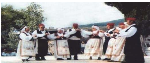
Photo 1: Residents of the Pope area, dancing the traditional "Ikariotikos dance".