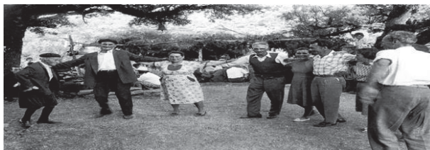
Photo 3: Ikarian people dancing the "Ikariotikos" dance ( Ch. Malachia file, 1968).

In part B, we have nine movements in total during which, the dance starts with a footing in the right foot (1) and a swing in the left (2), which starts sideways and to the back of the right with eventually a footing in the left to the right (3), consequently a footing of the right foot to the right (4), an opposite footing in the left to the left (5) and again right's footing to the right (6) and finally, we have a left foot's footing before (7), a right's footing on the toes next to the left (8) and in the end footing of the left, next to the right (9) almost in place. For the " New or Newer Ikariotikos " we have only one part, which is the same to the part b of " Tsamourikos " or " Peramaritikos " or " Rachiotikos Ikariotikos ", (Photo 3).