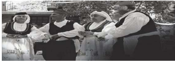
Photo 2: Ikarian people are dancing the "Old" Ikariotikos or "Sympethera".

All dancing phrases of these variations are structured by similar kinetic elements. The duration of each kinetic pattern is specified by the duration of the corresponding rhythmical, without meaning that in the dance's development process, within time, any particular delays or abbreviations of the individual rhythmical motives are observed. All these variations depend on the moment intentions, both from the dancers and musicians, (Photo 2).