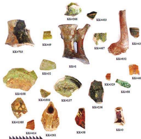
Figure 1. Fragments of glazed ceramics from the excavations in Kazan Kremlin

48 fragments of the total number are connected with the period of the Kazan Khanate. There are 5 fragments from the late period of the Golden Horde. The rest of finds has no stratigraphic referencing or is derived. The ratio of products from the processed beddings most likely assumes their penetration from layers of the Khanate period. Samples of fragments of the studied ceramics are shown in Fig. 1.