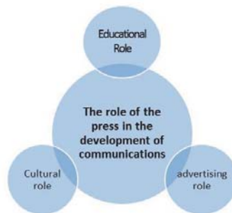
Figure 2: The role of the press in the development of communications