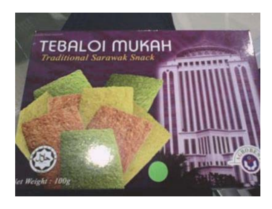
Illustration 4: Example of [təbaluy]

(təbaluy). A sweet cracker made from sago starch, egg, coconut and sugar, flattened until thin and roasted until crisp.