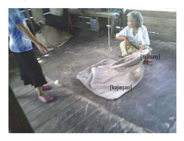
Illustration 4: The [takuən] and [kəjanan]

[kəjaŋan]. A square plaited mat continuously manipulated up and down to produce properly rounded sago pearls from sago starch. Similar to tapioca pearls, sago pearls can be used as a food or beverage component, ranging from South African baked sago pudding to Taiwanese bubble tea.