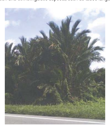
Illustration 1: The [balaw] tree, Metroxylon sagu

Lumbiya (Cebuano), rumbia (Malay), umbizo (Kadazan), tumba (Gorontalo), and humbia (Sangir); see Dutton (1994). Note the cognate is also found in the eastern branch of Malayo-Polynesian, for example lapia (Asilulu in eastern Indonesia); see Collins (2007). However, in Melanau (a subgroup of PMP) the term for sago palm has been replaced as balaw. According to Blust (2015), balaw is reconstructed in Proto Western Malayo-Polynesian as a kind of tree yielding timber (see also Zorc, 1994.) Wilkinson's (1932) definition of balau in Malay includes a verbal form membalau 'to pare off... to husk off', perhaps suggesting the process of producing sago pith into a starch or 'flour'. So perhaps the Melanau term suggests a semantic shift of the term for the production process to describe the entire sago palm. Of course, further study, both in semantic reconstruction and ethnolinquistic aspects, such as taboo language, should be carried out.