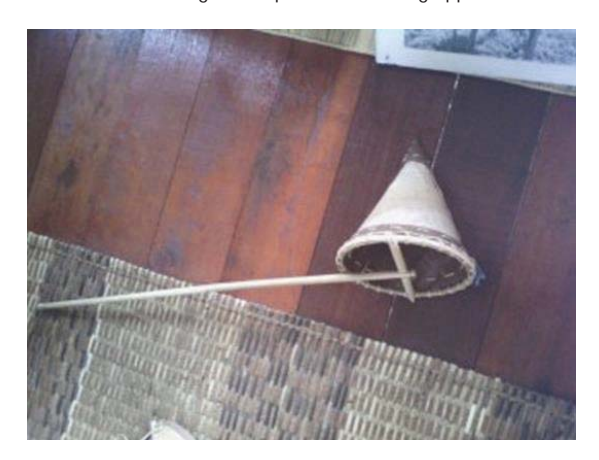
Illustration 3: A bailing bucket, the [təɣusuəη]

[təɣusuəŋ]. A conical container with a long handle used to bail water from the river and pour the water over the grated sago pith ([pəw]) while a worker is treading on the pith in the filtering apparatus.