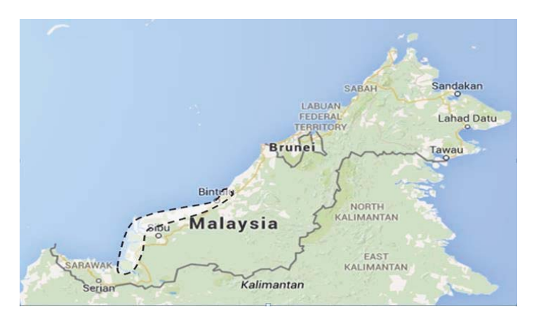
Map 1: The Metroxylon sagu area of distribution in Sarawak (modified from Google Map)

The sago palm ( Metroxylon spp. ) is found from 17°S and 15-16°N latitude ranging from Thailand, peninsular Malaysia and Indonesia to Micronesia, Fiji and Samoa in the Pacific region (McClatchey et al. 2006). In eastern Indonesia, the sago palm has long been processed as a major staple food especially in traditional societies, for example in New Guinea and many parts of the Moluccas,. In addition to its use as a staple food, sago starch produced commercially has become an ingredient in other foods, such as fish crackers ( keropok ), baked goods, and puddings, as well as a starch used in the manufacture of other food products. In Sarawak, Malaysia, the sago palm, Metroxylon sagu , is found in freshwater swamps, along the coast of Sarawak especially in the Rejang and Saribas deltas. According to Jackson (1976), this plant grows in swamps areas in Matu, Oya, Dalat, Mukah, Balingian, Saratok, Beladin and Pusa'; see Map 1. In the middle of the nineteenth century, sago production gained significant economic importance in Sarawak because half of the world's sago supply was produced in Sarawak. However, in 1950s, sago production declined when this commodity's market price fell. Since that time, many local sago producers abandoned this sector and sought other job opportunities, for example in logging, oil fields and fishing. Nonetheless, Sarawak continues to produce sago starch both commercially with modern techniques and traditionally for local needs.