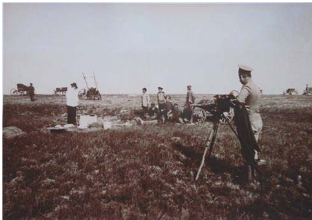
Figure 5. A scientific expedition to the Orenburg steppe. [The venue and date of expedition isn't known]. Guards - the Orenburg Cossacks. Museum of the Orenburg Cossacks history

In a collection of the museum of the Orenburg Cossacks history there is the most rare picture on the back of which it is written: "A scientific expedition to the steppe. Guards - the Orenburg Cossacks". Unfortunately, it is the copy from the photo from a private collection. Not dated. But nevertheless it does not lose a scientific and historical value because it has captured realities of that time: all scientific expeditions had military maintenance. It is also possible to see conditions in which researches were conducted.