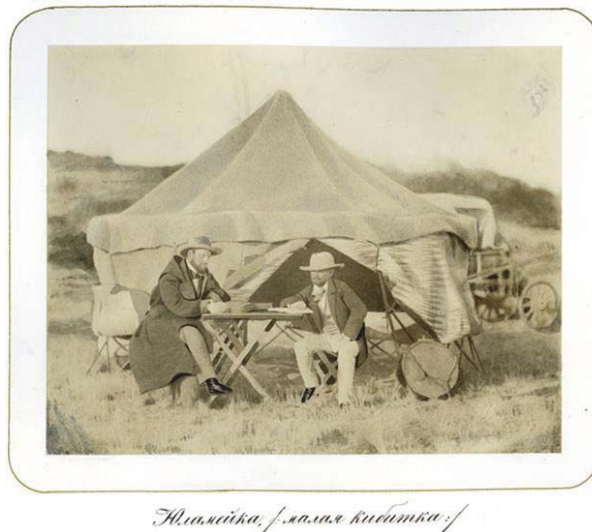
Figure 3. Yulameyka (small tilt cart). [Kazakh steppe]. A.S. Murenko's photo. (1858) IHMK photoarchive. Q 211. Ph. 4.