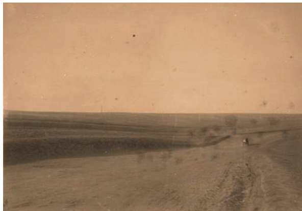
Figure 6. A view of the district around the 6th verst the road from Orenburg (the steppe of the right side of the valley of the Urals). Date of shooting [the 1900th]. A place of shooting is the Orenburg pr. CSAFPD SPb. П 361. Ph. 1.

The photo from the album called above can allegedly date 1903-1911. Unfortunately, they are not really in high quality, but nevertheless we now can not only see how the steppe landscape on the road from Orenburg to Orsk, but also church to the settlement of Nezhinsk, a household scene at the river.