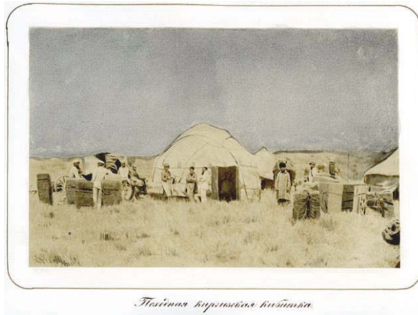
Figure 2. Marching Kazakh tilt cart. [Kazakh steppe]. A.S. Murenko's photo (1858) IHMK photoarchive. Q 211. Ph. 3.

Such episodes of a camp life were also captured by A.S. Murenko.