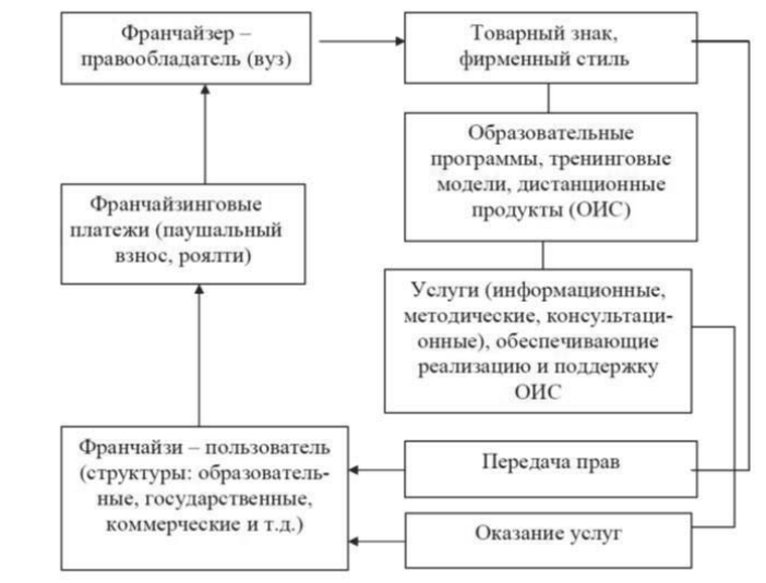
Figure 1 – The structure of education franchising

The structure of the interaction between the participants of the franchising activity in the educational environment is shown in Figure 1.