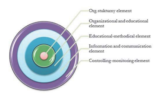
Figure 2 – The basic elements of the model of innovative bachelor's and master's degrees training in distance education

Later in this article let's look at each element in more detail. Speaking of the new forms of organization of the educational process, based on the principles of modularity and algorithmization, it should be noted that for the purpose of optimization of the educational process it seems efficient to use a model of the innovation system of bachelor's and master's degrees training in distance education, basic elements of which are presented in figure 2.