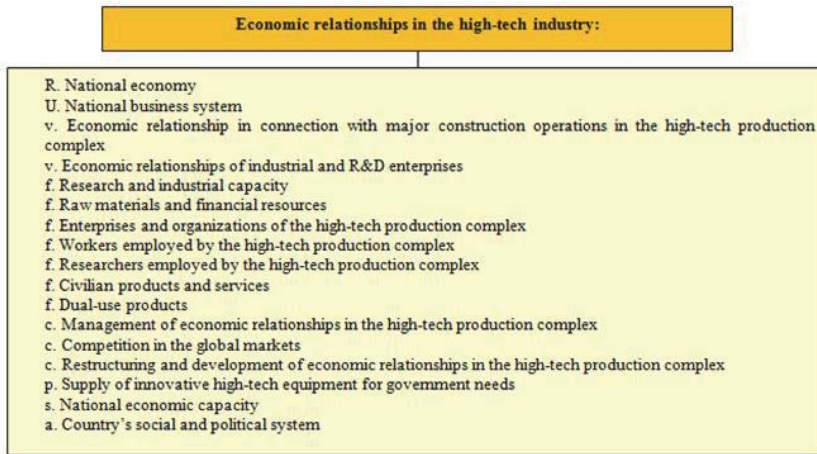
Figure 1. Thesaurus article on “The economics of high-tech industry” object