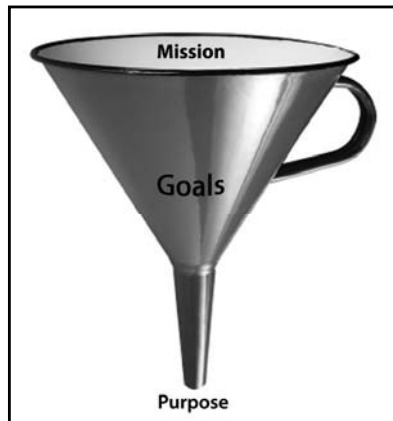
Figure 1.2. The Relationship Between Mission, Goals, and Objectives

Objectives , on the other hand, are short-term, specific performance targets that are attainable, measurable, and controllable. Every objective should reflect some general business goal and include a technique for measuring progress toward its accomplishment. To be meaningful, an objective must have a time frame for achievement. Both goals and objectives should relate to the company's basic mission (see Figure 1.2.).