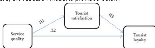
Figure 1: Research model

Service quality was measured based on Parasuraman et al. (1988). In fact, five dimensions of service quality were considered in this research includes tangible, reliability, assurance, responsiveness, empathy. Furthermore, based on the literature tourist`s satisfaction is provided as mediator variable by four questions and loyalty was provided as independent variable by six questions. Therefore, the research model is provided below: