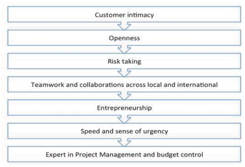
Figure 1: The value that governance promotes