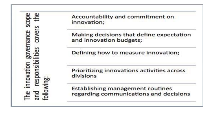
Table 1: Innovation Governance Scope And Responsibilities

Innovation governance usually commences with top management commitment to promote various types of innovation in the organization where it encourages all employees to grab opportunities for innovation in all aspects. There are four functions of management to promote all types of innovations namely: