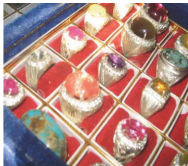
Picture 2. Diversity of Agate as Accessories

He wears his agates in his daily activities either at his house or at his office, in his right and left fingers. What he wears is the couple agates from any variations. It has been years he normally lives in this way, nothing to do with mystical practices. It is only a social symbol.