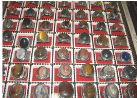
Picture 1. Diversity of Agate as Talisman