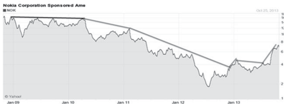
Fig. 3. Nokia's shares (2009-2013) [13]

Nokia's shares are depicted on Figure 1.