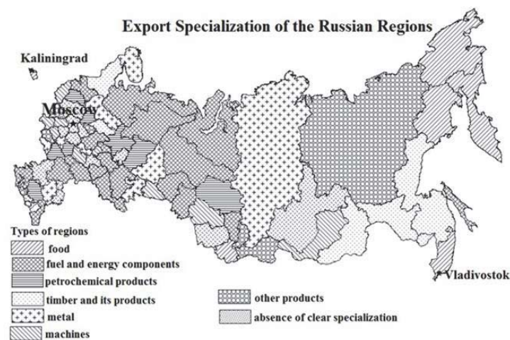
Fig.2. Export Specialization of the Russian Regions