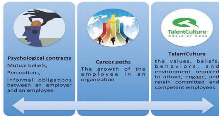
Figure 3: Talent Management process