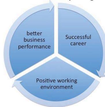
Figure 2: Talent Management and Organization