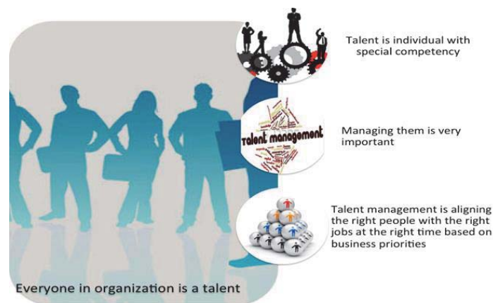
Figure 1: Talent and Talent Management

People are increasingly valuable source of sustainable competitive advantage for organizations, therefore, getting and keeping the right people in the right places at the right time has never been challenging, in fact, that is the way of talent management approach.