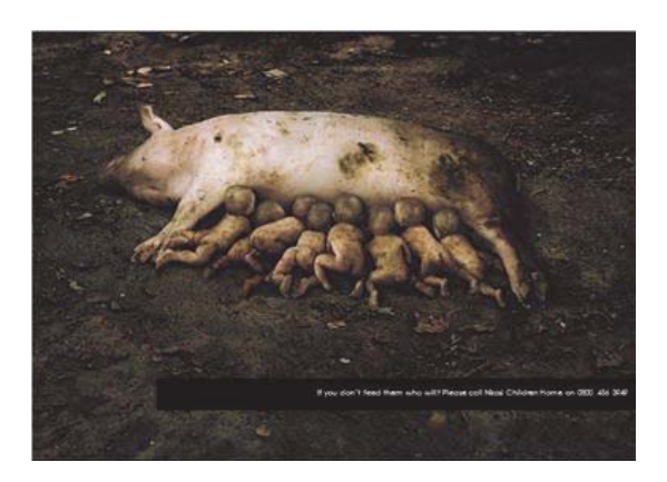
Figure 3: Advertisement 2: Nkosi Children Home (Moral Offensiveness)

b) Figure 3 (Advertisement 2: Nkosi Children Home) indicates an advertisement that makes use of 'Moral Offensiveness' (Dahl, et al., 2003) and depicts infants suckling from a pig with the tagline 'If you don't feed them, who will?' This advertisement puts children in a situation where the viewer feels uncomfortable. It is morally offensive and makes use of unfair or improper behavior as this is not a normal situation for infants, as they should rather be feeding from their mothers as opposed to a farm animal. This advertisement aims to get across a message that if parents, or a Children Home, are unable to care for infants, they would have to resort to other sources for comfort and food.