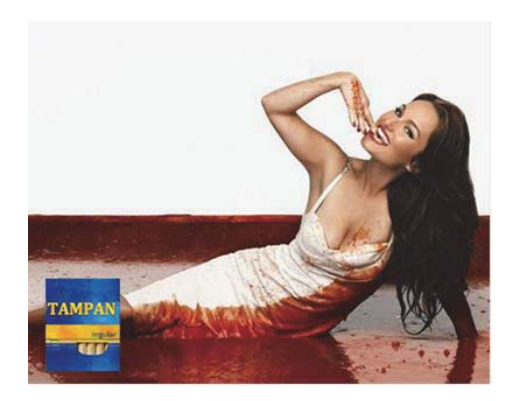
Figure 2: Advertisement 1: Tampan (Impropriety)

a) Advertisement 1: Tampan (See Figure 2) falls under 'Impropriety' (as stated by Dahl, Frankenberger & Manchanda, 2003) as it violates social conventions. Women's menstruation is not a publicized event but is considered a private matter of women. In this advertisement, menstruation is almost made fun of as the woman has a large smile on her face and the use of blood is over exaggerated. The message is that if you use that particular brand of tampon, a woman will be able to prevent the situation depicted.