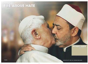
Figure 6: Advertisement 5: Avantgarde (Religious Taboos)

e) The final advertisement (Figure 6: Advertisement 5: Avantgarde) makes use of 'Religious Taboos' which includes an inappropriate use of spiritual or religious people (Dahl, et al., 2003). In this clothing advertisement, the Pope of the Roman Catholic Church is seen kissing the Sheikh of the Al-Azhar Mosque. This is inappropriate because (1) it two men kissing which is seen as homosexuality, which is condemned and (2) it is two different religions (with opposing views) who are now kissing each other as if they are lovers and friends.