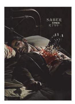
Figure 5: Advertisement 4: Saber (Disgusting Images)

d) In Figure 5 (Advertisement 4: Saber), the advertisement makes use of 'Disgusting Images' (Dahl, et al., 2003). It contains images of blood, harm to the body and death. This advertisement in Figure 5 shows a man being stabbed to death using a set of Saber knives, implying their sharpness and quality. This is not the normal setting for a knife advertisement, as they are normally shown cutting food or wood or steal (to show their durability and sharpness).