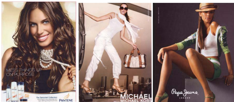
Fig.5. Advertisements depicting women as beautiful, thin and tall.

I’ve been studying these issues for decades and I still feel awful almost every time I read a fashion magazine. My belly is too round, my skin is marred by sunspots and wrinkles, my teeth not white enough, my nails not perfect. It’s easy to write this off as trivial vanity, but the impact can be deep and serious. It makes it difficult for a woman to feel safe, at home in her body and, therefore, in the world (1999, pp. 258-259).