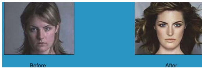
Fig.6. Face of a model before and after artificial creation. http://www.youtube.com/watch?v=Q-9tmCrEXdl