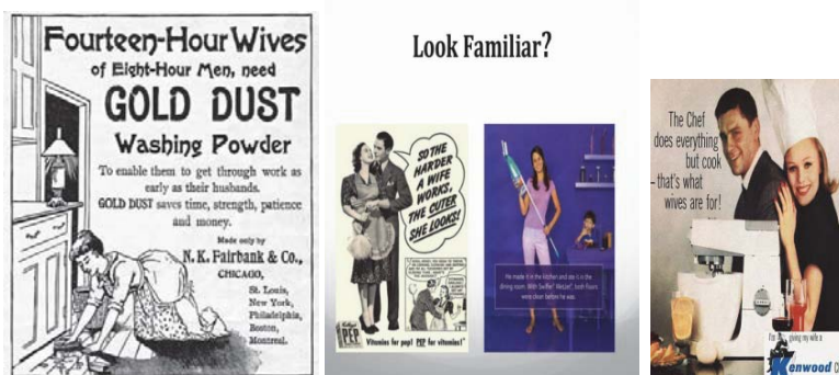
Fig.1. Advertisements depicting women as a housewife and a mother.

The depiction of women is one aspect of advertisements which is in need of change. Advertisers have been following three types of stereotypes in portraying women: they are weak, they are beautiful, and they are sex objects. A female body is used as a medium to convince an audience to buy services and products. Women and their body parts are used to promote and sell everything from cigarettes to drinks to body sprays and to men's clothes. Especially of interest are the debates about the presence of females in advertising. Wells, Burnett and Moriaty (1997) argue that females are used in advertising because they are responsible for most of the purchasing done for their homes. However, as the fair sex of the society, their bodies are sexualized to catch viewers' eyes. Whatever the debate, it is clear that they are the victim of popular culture in a male-dominated advertising industry. The male constructed images of women reinforce the stereotypes of women as an inferior being and sex objects. Marginalizing, subordination and commodification of females in advertisements are on the rise to the extent that one would think the industry is celebrating chauvinism. Domesticating the women was one of the early stereotypes reinforcing the idea that a woman should be a good housewife and a good mother. Women were, oftentimes, depicted in the home and happily engaging with the household chores (fig.1).