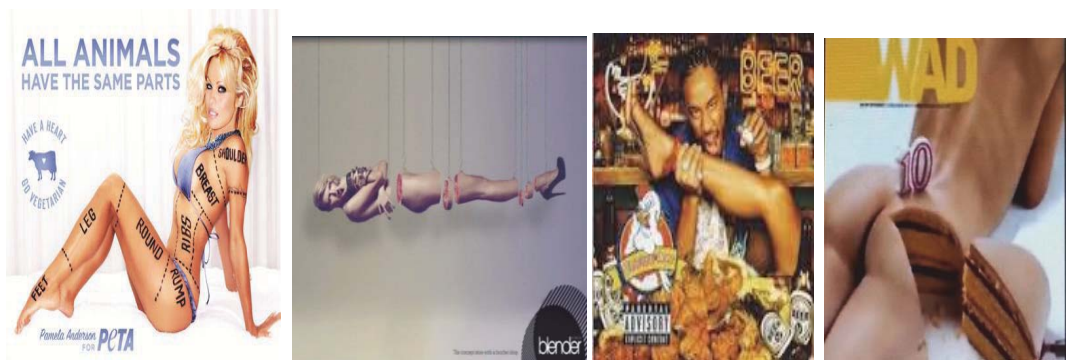
Fig.3. Advertisements depicting women as separated parts

women's subordination. The enforced economic dependence of many women on male providers has contributed greatly to the perpetuation of that power difference and the survival of patriarchy.