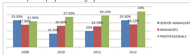
Figure 1: Female presentation as per employment category 2009 to 2012