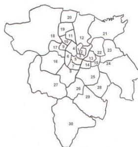
Figure 1. An outline of Rzeszów parishes in 2010. 2

After the communism had fallen, during the political transformation accompanied by the democratization of public life and by the emergence of civil society, the parish structure in Rzeszów developed without much ado and with the help of residents – accordingly to their needs, activities and finances. This process of parish structure concentration is continued since 1992 by the bishop of Rzeszów, Kazimierz Górny (Pierwszy Synod Diecezji Rzeszowskiej, 2004: 47-49, 79; Nabywaniec, 2010: 167-169).