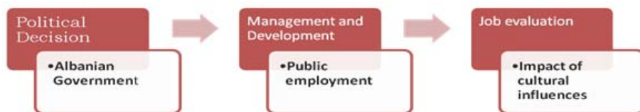
Table 2: The heads of central and local government institutions, Source: Albanian BB for Albania, report 2011