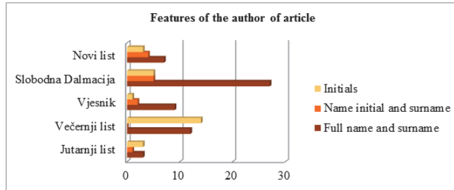
Graph 4. Author signature of newspaper article