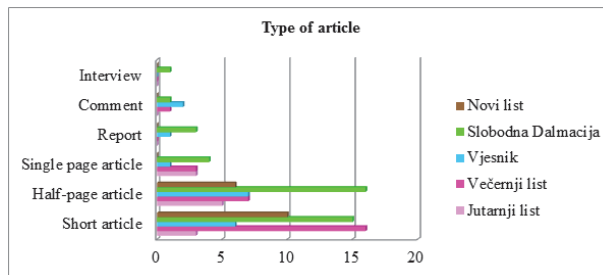
Graph 2. Type of article on rural topics in daily newspapers

Type of article shows the prevailing forms of reporting in newspapers. The results of research (graph 2) show that editing politics of newspaper prefer neither interviews nor reportages, but the advantage is given to the reports in the form of short news (up to ten lines) or to half-page articles. These articles are often accompanied by photographs which will attract reader's attention.