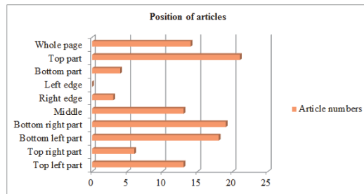
Graph 1. Position of articles on rural topics in daily newspapers

economy issues in agricultural sector. However, the results of research (graph 1) showed that the majority of analyzed articles were positioned on the most read part of the page. The articles are mostly positioned in the upper part of the page, and then in the lower right part of the page. This was entirely contributed by the events from the period of analysis: milkmen protests due to low purchase price of milk, as well as disputes of Croatian fishermen with Slovenian government in the Bay of Piran.