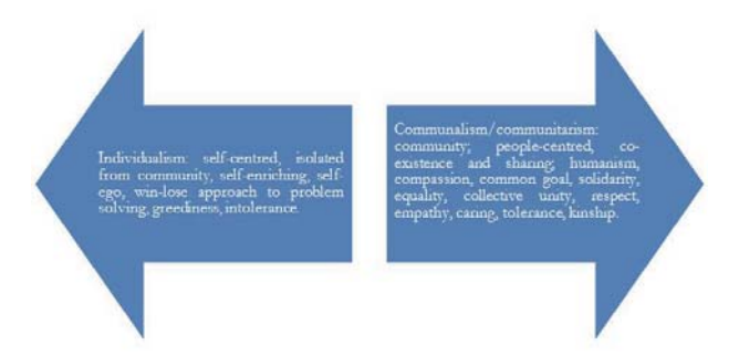
Figure 2: Individualism mode

The mode figured above is opposed to the individualism mode in figure 2. The individualism mode places a high premium on an individual person. It is opposed to communalism as illustrated through arrows pointing in opposite directions in figure 2. This mode has a potential to cause divisions in the community and is an enemy of ubuntu.