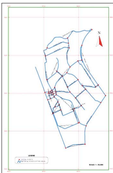
Fig. 1: Satellite Map Showing the Road Network of Ikeja, the Study Area

In this case, Fig. 1 shows the satellite map of the study area and indicates the total number of arterial roads traversing the neighbourhoods.