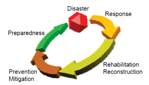
Figure 2: Disaster management cycle

MunichRe (2005) specified that economic damage caused by urban floods is rising. In Nigeria, many marked flood disasters have occurred in her urban areas with 2012 occurrence heightening the need for flood management. Aderogba (2012) in his study of 25 cities/towns in Nigeria, identified the frequency and duration of floods. The study indicated that Benin City experiences flood duration that last up to 10 days and mean lowest rain duration of 12 days. The high frequency coupled with urbanization aggravates flooding extensively by restricting where flood water can flow (Ojigi et al, 2013). In most cases, the devastation caused by urban floods especially on households is usually a reflection of their lack of preparedness. According to IFRC, (2007), none preparedness, poor and low budgetary allocation for disaster prevention in developing countries make them experience greatly the impacts of natural disaster. No country is immuned to flooding and the impacts are heightened by lack of capacity and preparedness.