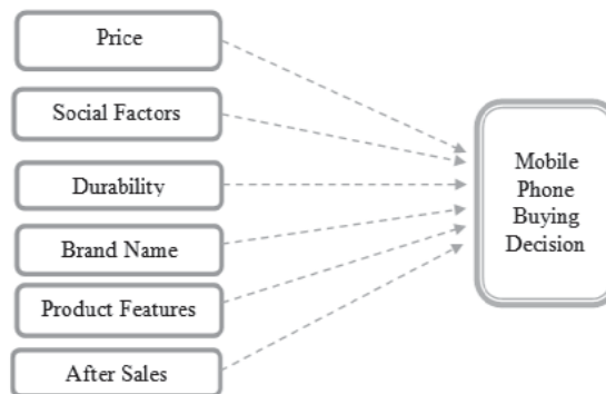
Figure1: Conceptual framework of the study

The research is examined through the following hypotheses: