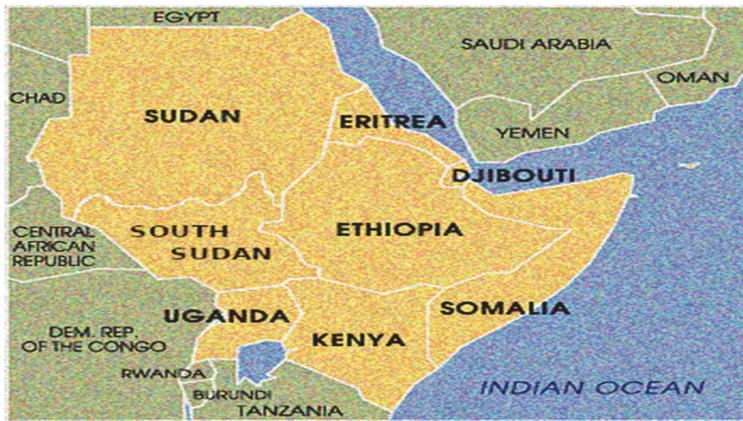
Figure 1: Map of the Horn of Africa

region has become an unstable region and constant political instability with both intrastate wars and interstates crisis of all manner which has plagued the region for a very long time. The most unfortunate part is that most of the states in the region are fragile, with weak institutions incapable of effective governance and maintenance of security and control of their borders. The HoA is a position in an outstanding geopolitical location southwest of the Red Sea and the Gulf of Aden. That location refers to these four countries namely, Ethiopia, Eritrea, Somalia, and Djibouti however, taken in a wider and economic context the term the Horn of Africa includes Sudan, South Sudan, Kenya, and Uganda. This is shown in Figure 1 below.