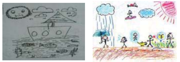
Figure 6. illustrates the combination of places and times in a one space (percept formality stage)

3.5.6 Combine different places and times in one space: