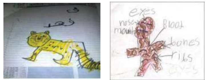
Figure 7. illustrates collect writing with drawing in children's drawings (percept formality stage)

The use of writing in the drawing becomes necessary whenever got a child to a degree of education school which is dispensed by all the shapes that can not be are expressed painting or used writing as a way to clarify what thought he was mysterious for others. (Abdel Razek Mohamed El Sayed: 2003, 70: 71)