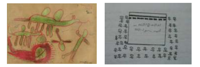
Figure 1. illustrates repetition of shapes in children's drawings (percept formality stage)

" Is the direction to the ongoing repetitions of a number of shapes and elements, and stability on a certain number of shapes repeated on a continuous basis." (Hamdy T: 1962, 29)