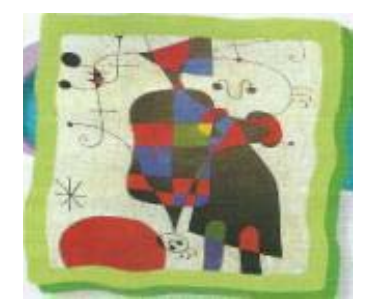
Form (9) of the Works artist Joan Miro

3.6 Children's drawings in the work of contemporary artists: