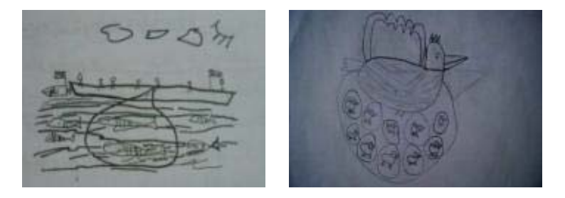
Figure 4 . illustrates the transparency in the fees of children (percept formality stage)

And appear when intersected elements not baptizes learner cancel each to express the near and long term by the tendency the internal him, "has been named this phenomenon fees X-rays to between the direction of the child and including the semi his view through the surfaces, whether transparent or non- Transparency. (Mahmoud Bassiouni: 1984,173)