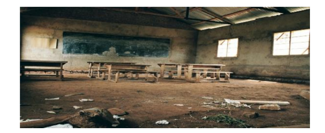
Figure 4: A classroom for Karimu kids

Fig. 4 above, is a typical example of what inadequate funds to provide the necessary infrastructures required for quality education look like. Due to this pressing issue, infrastructures are not up to the standard required for education to be impacting and productive. Therefore, students do not have access to the quality education they are legally entitled to (Dike & Salisu, 2015).