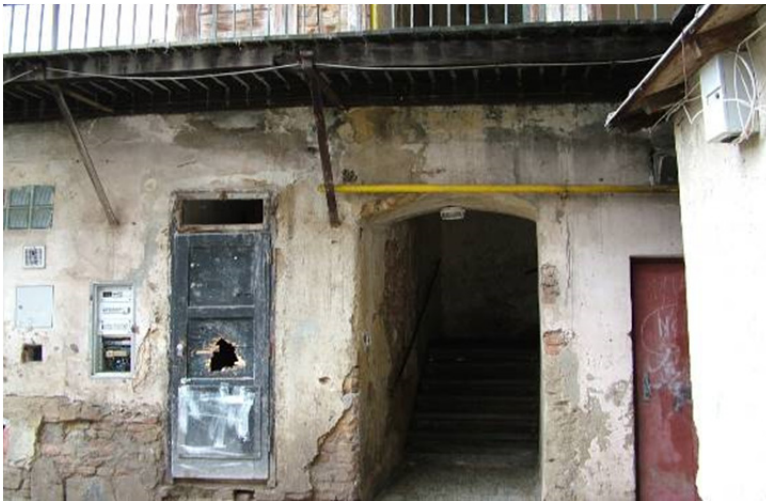
Fig.: Entrance into the residential house on Cejl Street in Brno. Poor quality of housing inhabited by Roma population