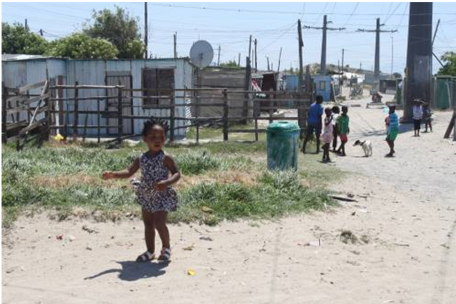
Fig.: Khayelitsha informal settlement in the Western Cape.

Typical township homes are built from corrugated sheets of metal without having any foundations, standing on a sandy bed. Most often the homes are built on lands that are not owned by the occupier, so it is there illegally.