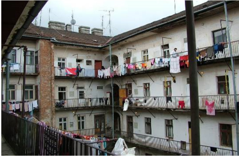
Fig.: Poor quality of housing in the residential house on Cejl Street in Brno inhabited by Roma population