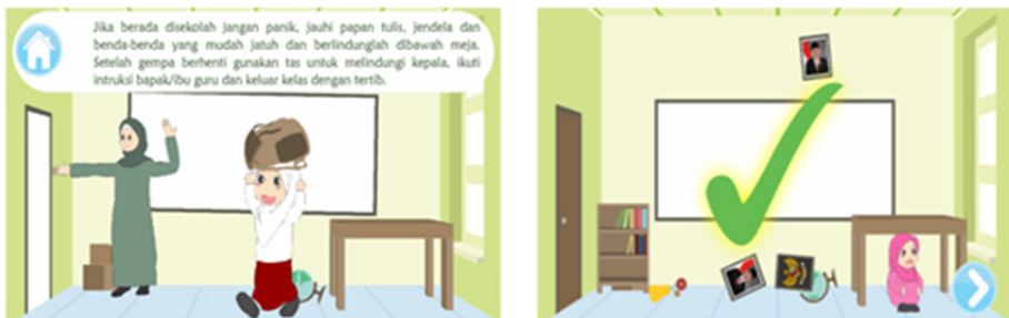
Figure 3. Simulation for Earthquake Preparedness in School