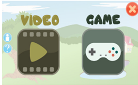
Figure 2. The Main Menu of Earthquake Learning Application