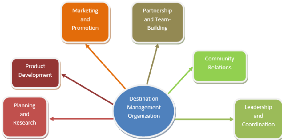
Fig 3. Roles of the Destination Management Organization in Interpretive Planning and Management of a Tourism Destination

As a collective process, destination management and interpretive planning involves national and local government, local authorities, cultural planners and few institutions, local communities, private operators, volunteers etc. cultural tourism destination planning and management involves a diverse range of processes and procedures that focus on sound and effective tourism experience with essential services, happenings and events and also it helps in reviving economic benefits for local economy, sustainable and responsible utilization of local resources and providing a quality visitor experience.