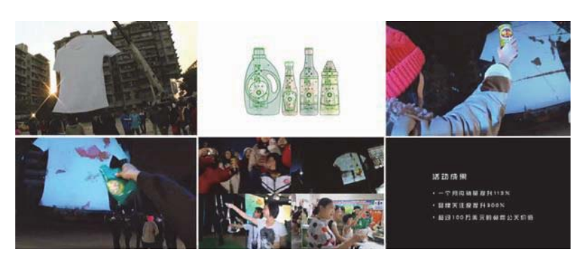
Figure 3. Ariel (2011) / The World's Largest T-shirt – video capture

outdoor, the gamepads were refitted to Ariel laundry detergent bottles and spice bottles. Many users held bottles of ketchup, soy, mustard oil, fruit juice, and splashed them on the T-shirt; soon, the T-shirt was full with all kinds of stain. The design of this scene is just like we accidentally got stains on the clothes at ordinary times and these stains were difficult to clean, with Ariel, however, we did not have to worry. The huge outdoor device provided us with a convenient way, as long as handheld Ariel products such as laundry detergent, the stain on T-shirts would be cleared off. This activity results showed that the sales increased by 113% in a month, and the brand awareness increased by 300%, more than the public relations value worth $1 million.