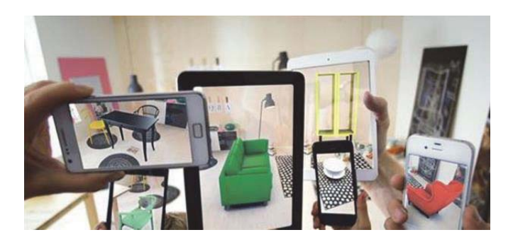
Figure 2. IKEA: "Product Manual" APP

There are countless advertising cases supported by interactive new media technology, for example, IKEA 2014 product manual was focused on and the combination of the indoor environment and its entertainment. Open the related applications, choose furniture, put the manual where you want to put the furniture, through the APP scan, you can see the appearance of each furniture in the home. The application effect is very intuitive and the choice becomes much easier. (e.g. Fig. 2)