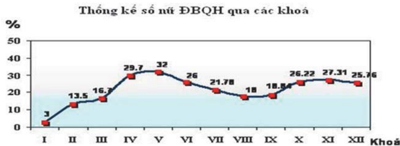
Figure: Percentage of women in parliament according to terms 5

Charts and tables indicate that, in National Assembly (from I to XII tenure), the 5 th National Assembly had the highest percentage of female deputies with 32.3%. The percentage of female deputies in National Assembly (tenure XIII) is 24.4% and ranks 43/143 countries in the world. Overall, in recent years, Vietnam is one of the few countries in the Asia - Pacific region with the proportion of female deputies at over 25%. The number of women holding important positions in Congressional offices has increased in recent time. However, in 9 consecutive parliamentary tenures (from V to XIII tenure), this ratio tends to decrease and creates horizontal line. This tendency proves the difficulty in the implementation of justice and equality for women in the National Assembly in Vietnam.