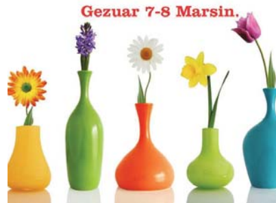
Figure 3: "Happy Teacher's Day"