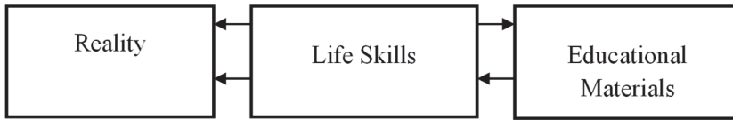
Figure 2. 1: The Correlation between Reality, Life Skills, and Educational Materials

Figure 2.1 illustrates that the stages of implementing life skill education are as follows: (1) identifying the life skills needed to face reality. (2) based on the identification, the forms of skills are arranged following the knowledge, skills, and behavior that support the skill formation. (3) classifying them in the form of themes or topics formulated in educational materials (Isa, Abd.Hamid. 2012).