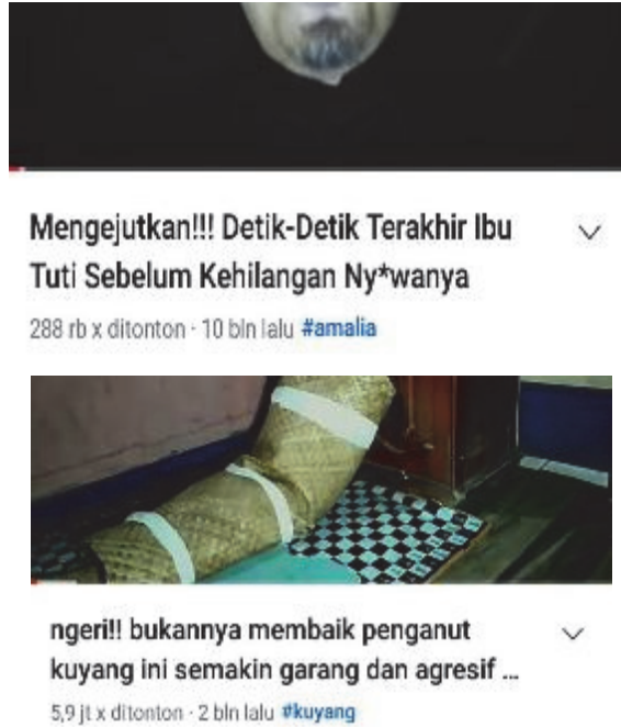
Figure 2: Trance scene of summoning spirits and genies in Youtube content