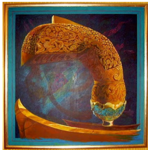
Figure 5: Din Omar “ Ukiran Indah Di Puncak Indah ” ( Siri Keris ) (2005), Acrylic on Canvas, 60 inch x 60 inch

The use of Tepak Sirih to await the arrival of guests is also a custom where Tepak Sirih is an important item during the visiting process of the guests and the host. In the past, if a person comes to a house for the purpose of visiting, the host will invite the guest to have a taste of the sirih with buah pinang as a custom of breaking the ice. This is evident in the event of the merisik or proposal entourage, where the guests would also carry the sirih as a token and the hosts will reciprocate by leading with their own sirih . However, they would first eat the sirih together before starting a conversation or discussion, indirectly reflecting the politeness of the Malay customs and culture from a long time ago.