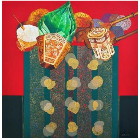
Figure 2: Din Omar, “Tepak Sirih Series” (1995), Mixed Media on Canvas.120 x 120 cm

The picture Figure 2 above depicts the Tepak Sirih , which is a signifier symbol of Malay heritage in weddings and engagement ceremonies in Malaysia. The Tepak Sirih has an aesthetic and also semiotic values as it is customary to present it in a Malay engagement and wedding ceremony. With the cultural substance of this heritage, the Malay community presents a richness in tradition which must be inherited by the younger generation. The heritage is also related to the symbols and the Tepak Sirih represents a philosophy of customary value in the special events.