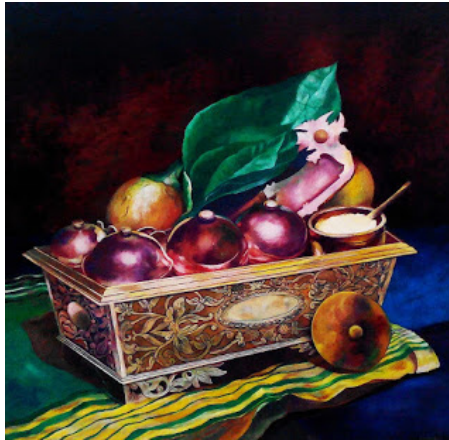
Figure 4: Din Omar “Siri Tepak Sirih; Menanti Tetamu Siri 5” (2008) Acrylic on canvas, 59 inch x 59 inch

Din Omar's painting artworks contains a sense of deep meaning in terms of signifiers of cultural materials such as the tepak sirih that has been emphasised in the series named “ Siri Tepak Sirih. Menanti Tetamu Siri 5 ” (2008) (Figure 4). The use of Tepak Sirih was widely practised by the people in Malaya. However, in the present situation, the maintenance of the Tepak Sirih becomes costly as it is difficult to preserve its cleanliness and shine.