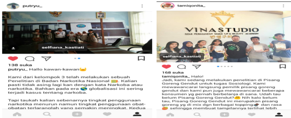
Fig. 5. Screenshot of one of the groups uploading their project to Instagram

The implementation of Instagram-Assisted PjBL model received positive responses from students. This can be seen when the students posted their project results on their Instagram account (Figure 5).