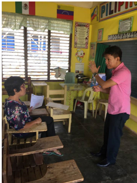
Figure 1. The researcher conduct one on one and group discussion about how to continue their research outputs.

They spent a lot of money to help below average learners love science and mathematics. But very few understand that this is innovations.