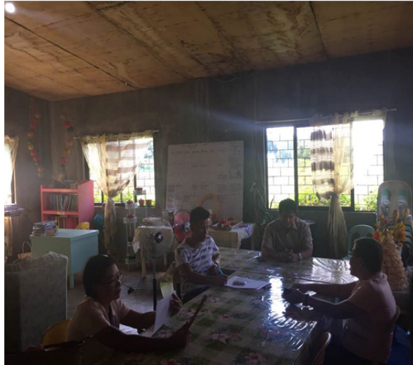
Figure 2 showed that the researcher take time to have a very positive relationship by explaining in details "What is Action Research and It's Important to Education System Today?"

Almost 8 informants formulate a proposal but only two submitted completed research paper; one from mathematics and one from science; both of them were in elementary.