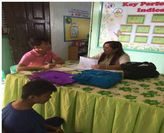
Figure 3. One on one interview with the research and the informant.

We are also encouraging the informants to finish their proposal within the year. We are willing to help them enhance their action researches.