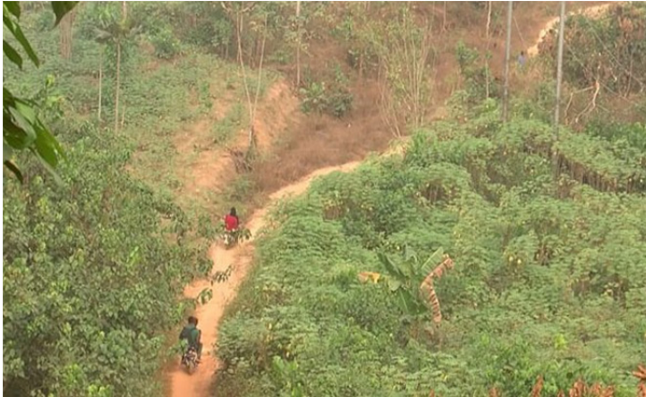
Fig. 2: Image of the only Road Access to Ekpene Eki Community in Odukpani LGA