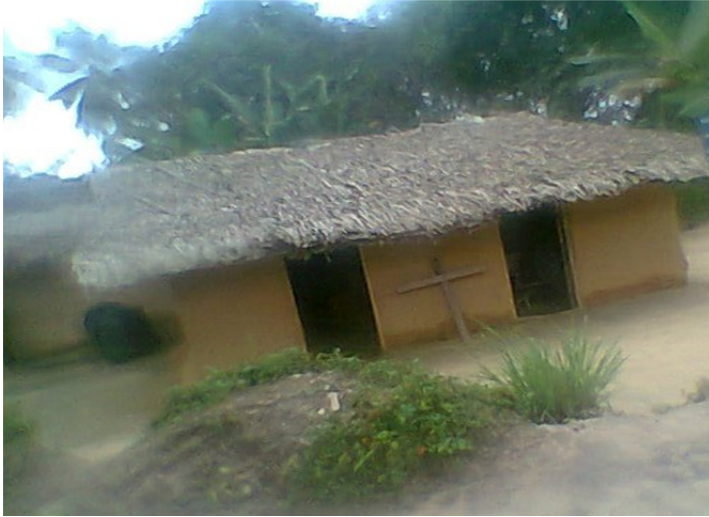
Fig. 1: A typical mud house in Creek Town village of Odukpani LGA