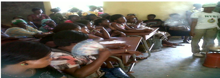
Fig. 4: Cross Section of Participants during the Skill Acquisition Program in Eseku Village