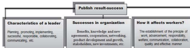
Table 4. Impact of the publication of results-success in organization