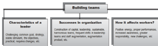
Table 2. Impact of building teams in the organization

Choosing and setting goals are the best ways to help the performance of workers, especially in achieving the financial goals that creates the possibility of sustainability of the organization that creates the possibility of sustainability of the organization