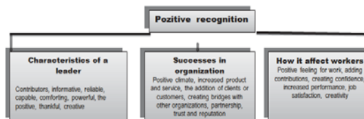
Table 1. Impact of positive recognition of the work in organization

Most of them do the job for money, as the best form for recognition the work. Therefore, there should also have any reward or bonus within or at the end of the diligent workers who deserve to be rewarded, which is one of the best ways to motivate employers