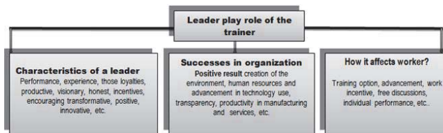
Table 5. Impact of the leader and his role as a coach in the organization

Transformational leaders use and engage with interpersonal communication skills during their discussion, exercises, which affect positively to individual performance. Trainer, is the skill that can be learned and argue experiences through individual performance