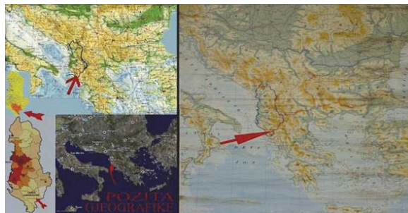
Fig. 1. Geographical position of Gjirokastra region

We should say that Ottoman cadastres are of great value regarding their extensive and detailed information because in them it is clearly documented the true nature, size, main economic resources, relations with civic centers, economic power, role of agriculture, crops, in the Albanian medieval village 1 .