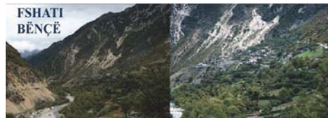
Fig. 5. The village of Bençë (Tepelena District)

fact that Albania did not go through the historical stages like feudalism and capitalism. Reflecting the different stages in the course of history have been established different practices in different areas. The 50-year-old socialist system in the field of construction introduced new traditions and changed the contents in accordance with the ideological and political goals. The changes that the settlements underwent during this time were both quantitative and qualitative. Quantitative changes consisted in increasing the number of buildings in rural areas thereby creating big rural centers tantamount to the city. Qualitative changes, consisted in an effort to adapt new community functions, according to political criteria and in accordance with the typology of the village. For this process, the necessary economic factor was government ownership of the land. As regards the socialist organization of state agricultural co-operatives, rural residential areas are generally characterized by agrarian and mixed settlements, but some villagers made a living working in industrial sectors (mining or wood processing that had been close to their homes). The basic principle of a regulatory plan regarding a settlement was building housing units in different socio-cultural centers.