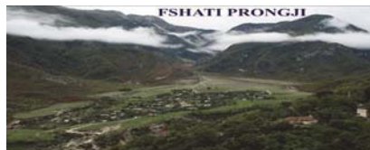
Fig. 4. Prongji village (Gjirokastra district)

Periods of changing socio-economic systems, the process of moving from the centralized economy to the free market economy can hardly offer other solutions to the mechanical movement of the population, except being spontaneous. This kind of movement carried with it a number of negative consequences in rural areas 13 . The dissertation titled "The dynamics of the Rural Area System in Gjirokastrë District 14 " in Human Geography presented on 19. 11. 2001, to obtain the Master's degree analyzes in Chapter II the issue: "Populating the ecosystem in rural area." In this chapter are also analyzed rural areas hierarchy and their typology and policies regulating the rural settlements.