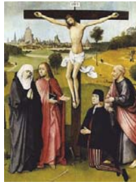
Fig.1 Christ on the Cross-H. Bosch 1