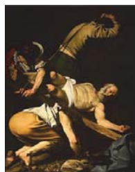
Fig.3 crucifixion of St. Peter by Caravaggio

If we stop over at (fig. 4) may see a very different attitude from the one that was first presented before surrealism. Dali presents Christ from an unusual perspective, viewing from above.