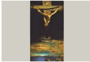
Fig.4 Christ of St. John of the Cross, 1951- S. Dali-1951 3

The view looks not human but very much divine where Father himself sees his son from above. In the works presented so till Dali realizes this work, we see that Crucifixion was seen by a human perspective, where the presence of Mary and other saints tell of suffering and the Bible discourse.