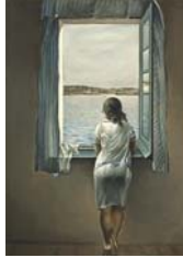
(Fig.6) Figure at a Window, 1925

Here Dali played with interior and exterior, with the divine and its sustainability, with humane instincts that bring continuity of erotic life by the birth of a creature again. Dali also played in this work with the observation from above to below and from below to topside.