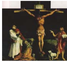
Fig.2 Mathias Grunewald

Differently it will be treated in the works of Francisco De Goya which would require more the humane and two dimensionality line. In artwork of Caravaggio (Fig. 3) the crucifixion is shown on the side from the top down, where for the first time we see a composition so brave in front of his crucifixion.