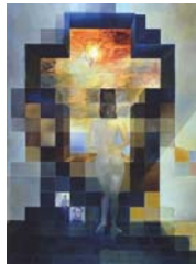
(Fig.7) Gala Contemplating the Mediterranean Sea which at Twenty

Meters Becomes the Portrait of Abraham Lincoln- Homage to Rothko (second version), 1976