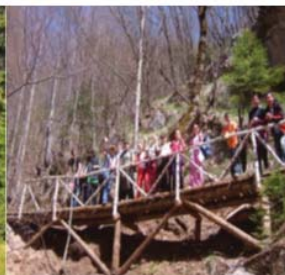
Bridge made of regional materials in Kosovo