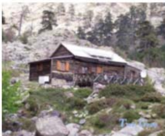
Mountain graze, sheperds cabin

Some examples from successful trail shelterings in world: