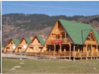
Lodge Rugova Mountains