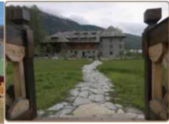
Ecolodge in Plav