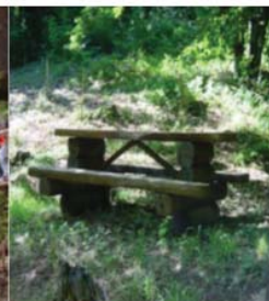
Picnic seats in Kosovo