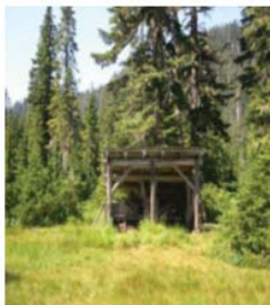
Protective cabins in Kosovo