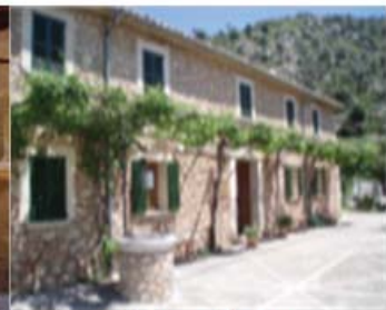
Ex livestock farm