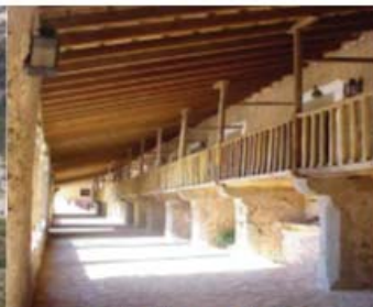
Ex oil mills in Mallorca