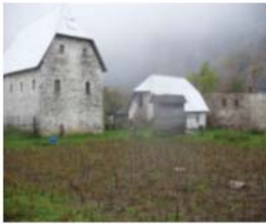
Guesthouse in Theth, Kulla