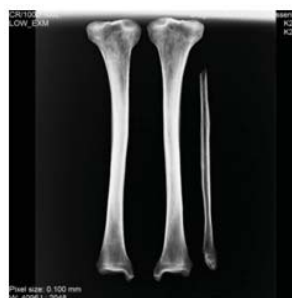
Figure 6: Lower extremities without signs of pathological process, anterior view of the individual K 235 (radiograph, author: Jessenius - diagnostic centre, JSC. 2013).