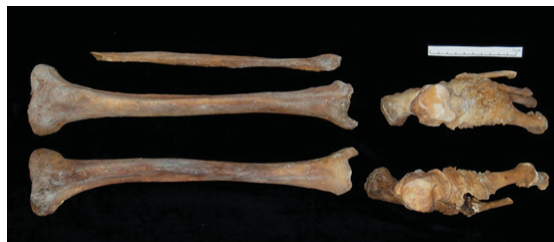
Figure 2: Human skeletal remains, individual K 235.

On the left side of the foot, we observe especially: calcaneus, talus, os naviculare, os cuneiforme mediale, os cuneiforme intermedium, os cuneiforme laterale, os cuboideum, ossa metatarsalia I, II, III, V. On the right side of foot were observed: calcaneus, talus, os naviculare, os cuneiforme mediale, os cuneiforme laterale, os cuboideum, ossa metatarsalia I, III, phalanx proximalis digiti pedis I.