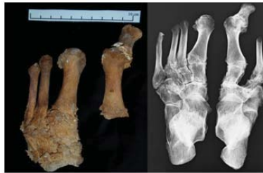
Figure 3: Ankyloses of the feet bones (left figure, photo: Tonková 2013), radiograph of the feet (right figure, author: Jessenius - diagnostic centre, JSC. 2013), anterior view of the individual K 235.