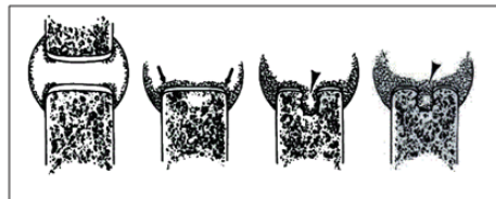
Figure 4: Pannus invading subchondral bone (arrows) resulting in trabecular erosion with formation of geodes (arrowheads) (Resnick, Niwayama and Coutts 1977).