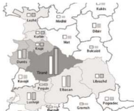
Fig 2. The absolut number of the population in the city and the % of the number of the population on district bases, 1989-2001

International migration continued to grow, largely as a result of low wages and wealth differences between Albania and neighbor countries, the public sector, inadequate infrastructure and service provision. Since 2001 the economy has improved steadily.