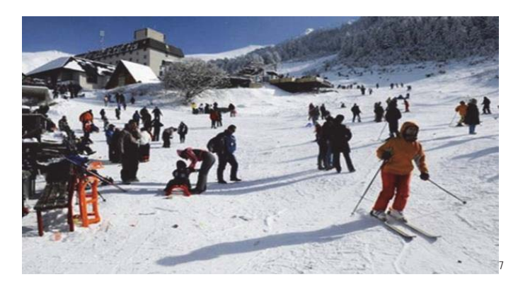
Figure 1 – Resort of skiing centre in Brezovica.

The most characteristic nature places are White Drini spring, Rugova Gorge, Mirusha Waterfalls, Skiing Center in Brezovica, Sharri Mountains and its national park, Albanian Alps or known as Cursed Mountains, Gadime's Cave whereas architectural parts are Peja Patriarchate, Old Market of Gjakova, Monasteries of Deçan and Graçanica as well as old town antique of Ulpiana City"- we continue to emphasize the same source<sup>4</sup> which makes us understand that what kind of foreign visitors read and get informed over the characteristics of tourism in Kosovo. We add that attractive to be visited are also Luboten and Gjeravica tops of the mountains, which is known as the highest top of the mountain that arrives the highness of 2.656 meter in Kosovo<sup>5</sup>. All of those data based in some statistics and the data over the revenues from tourism in our country, according to you, are not satisfied. The Republic of Kosovo is still an undeveloped touristic zone since the tourism participation in GDP of the Republic of Kosovo is low, / 1.0 %, in 2010. In the general structure of employment, tourism and accommodation takes only by 6%<sup>6</sup>.